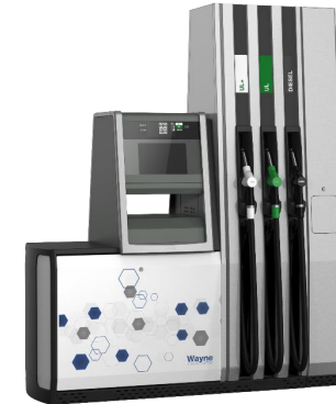
H6000 II Additive