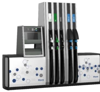
H6000 II B2B AdB