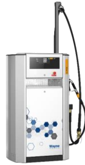
Century 3 LPG