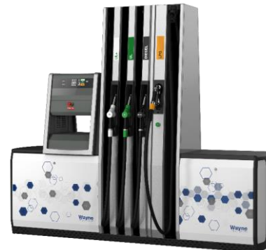
Available also as back-to-back