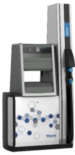
H6000 II AdB