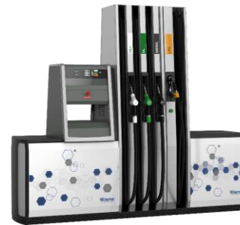
H6000 II B2B LPG