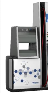
H6000 II CNG