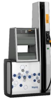
H6000 II LPG