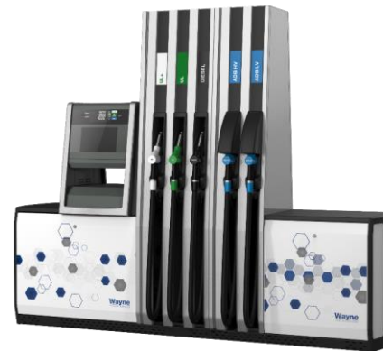
Available also as back-to-back