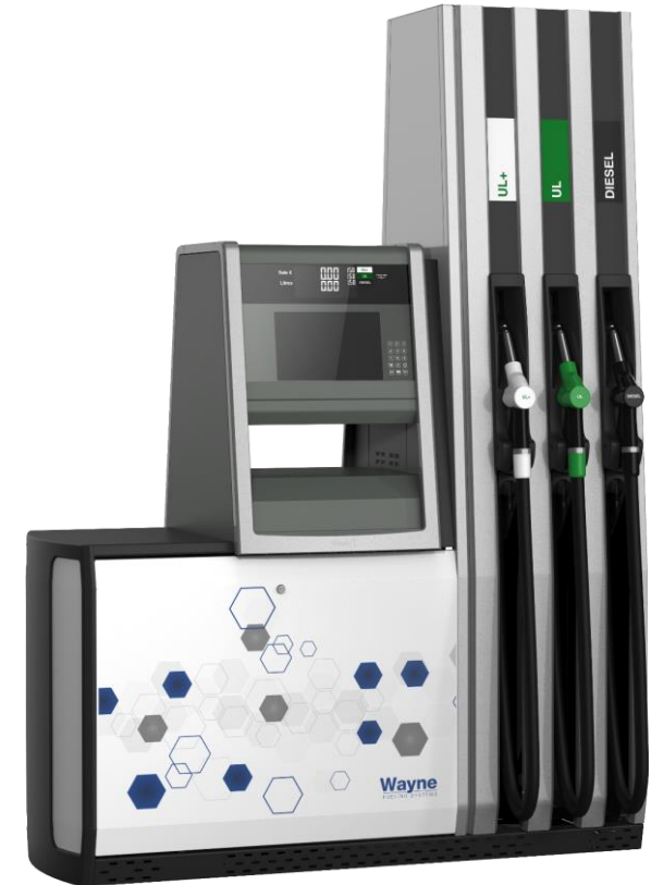
Helix 6000-II 3-6-3