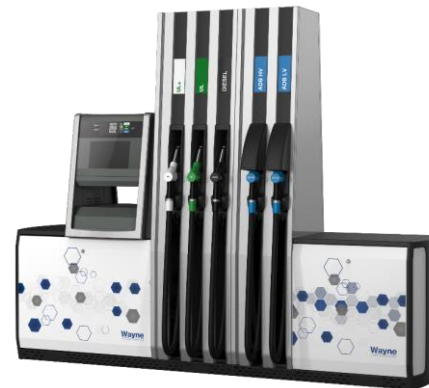
Available also as back-to-back for alternative fuels