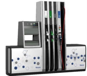
H6000 II B2B CNG