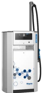
Century 3 AdB