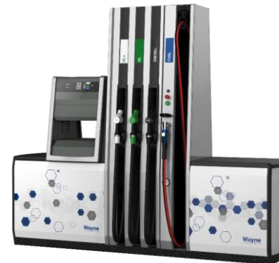
Available also as back-to-back